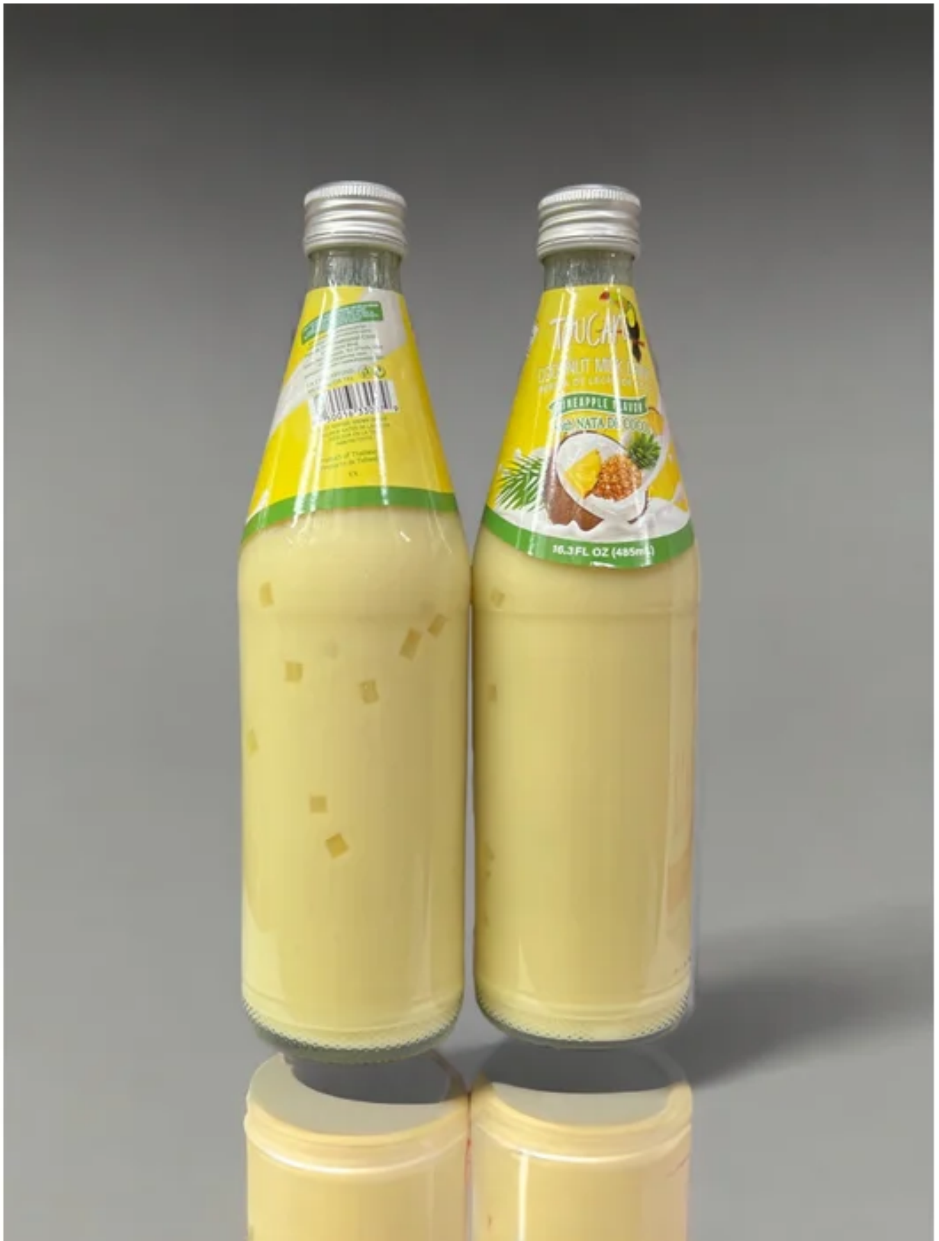
COCONUT MILK PINEAPPLE DRINK 12/16.3OZ