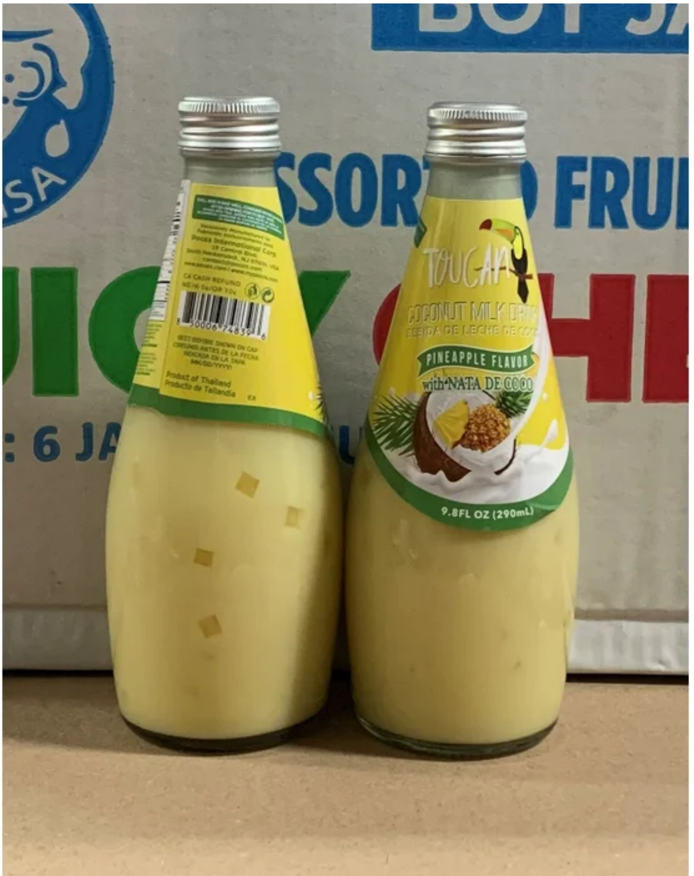
COCONUT MILK DRINK WITH PINEAPPLE 12/9.8OZ