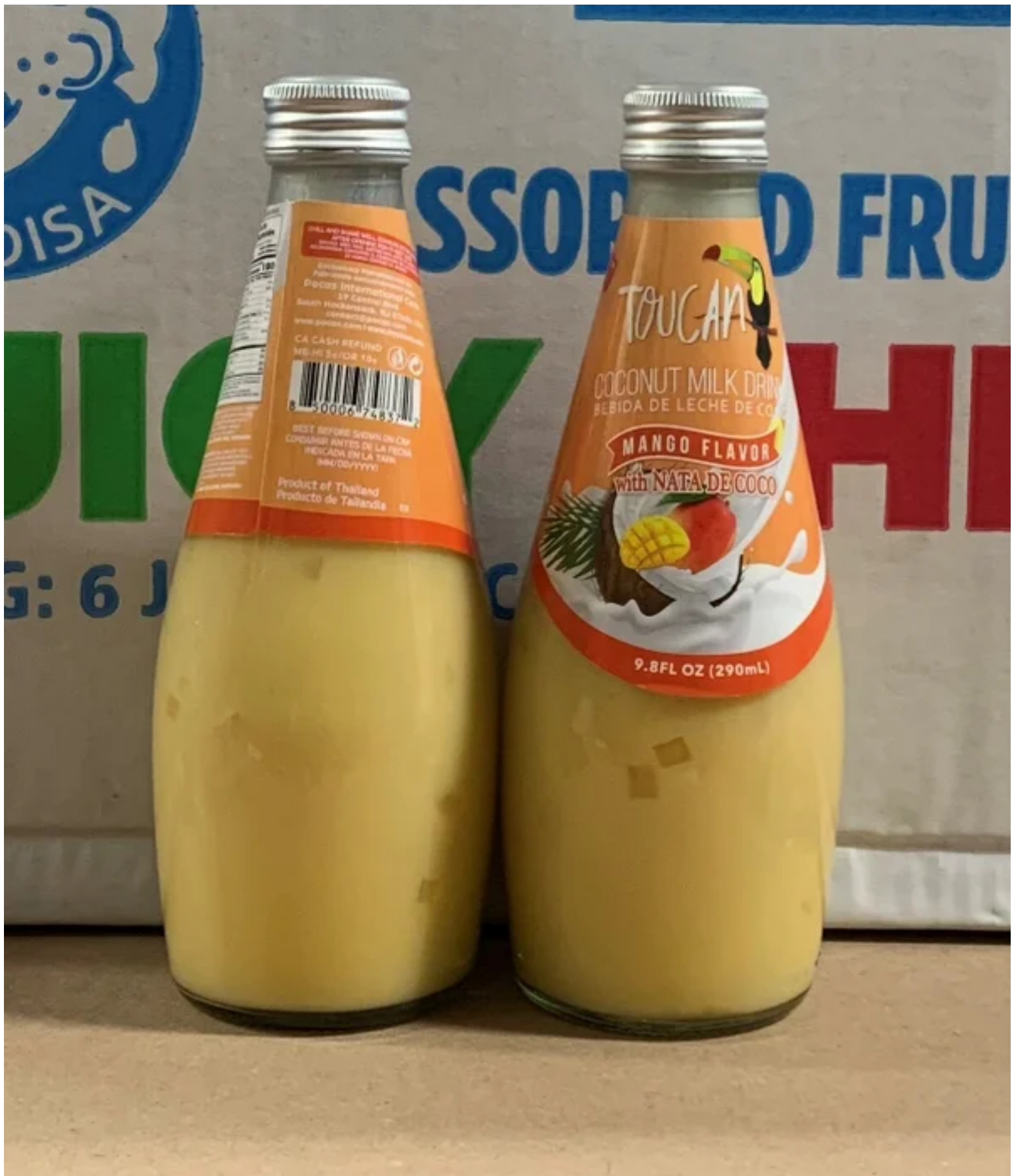
COCONUT MILK DRINK WITH MANGO 12/9.8OZ