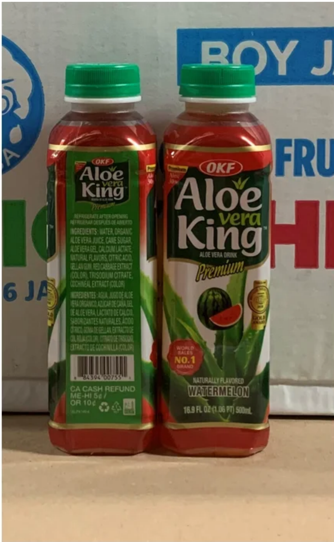
ALOE VERA KING WATERMELON 20/16.9OZ EXP 12/2023