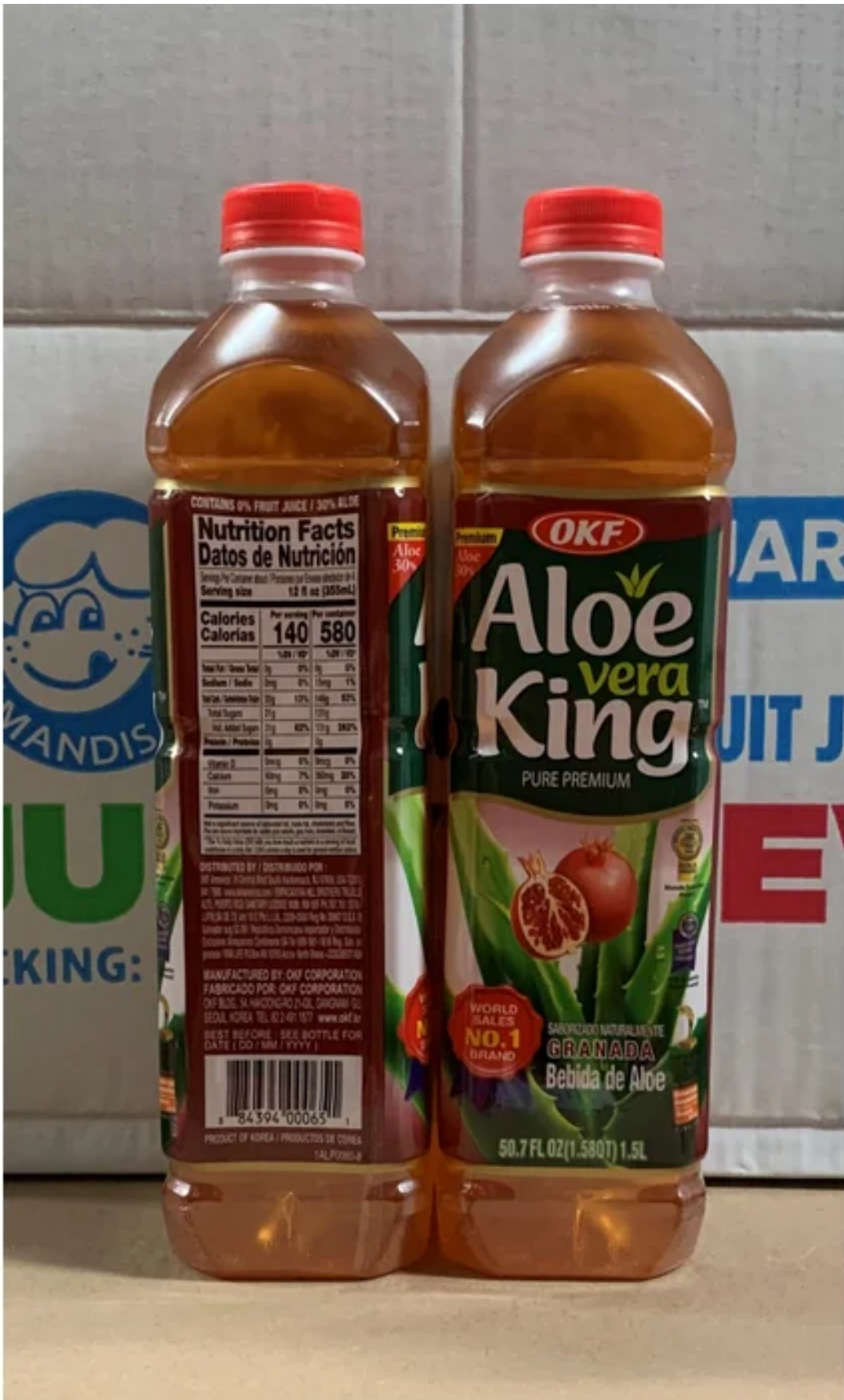
ALOE VERA KING POMEGRANATE 12/50.7OZ EXP 11/2023