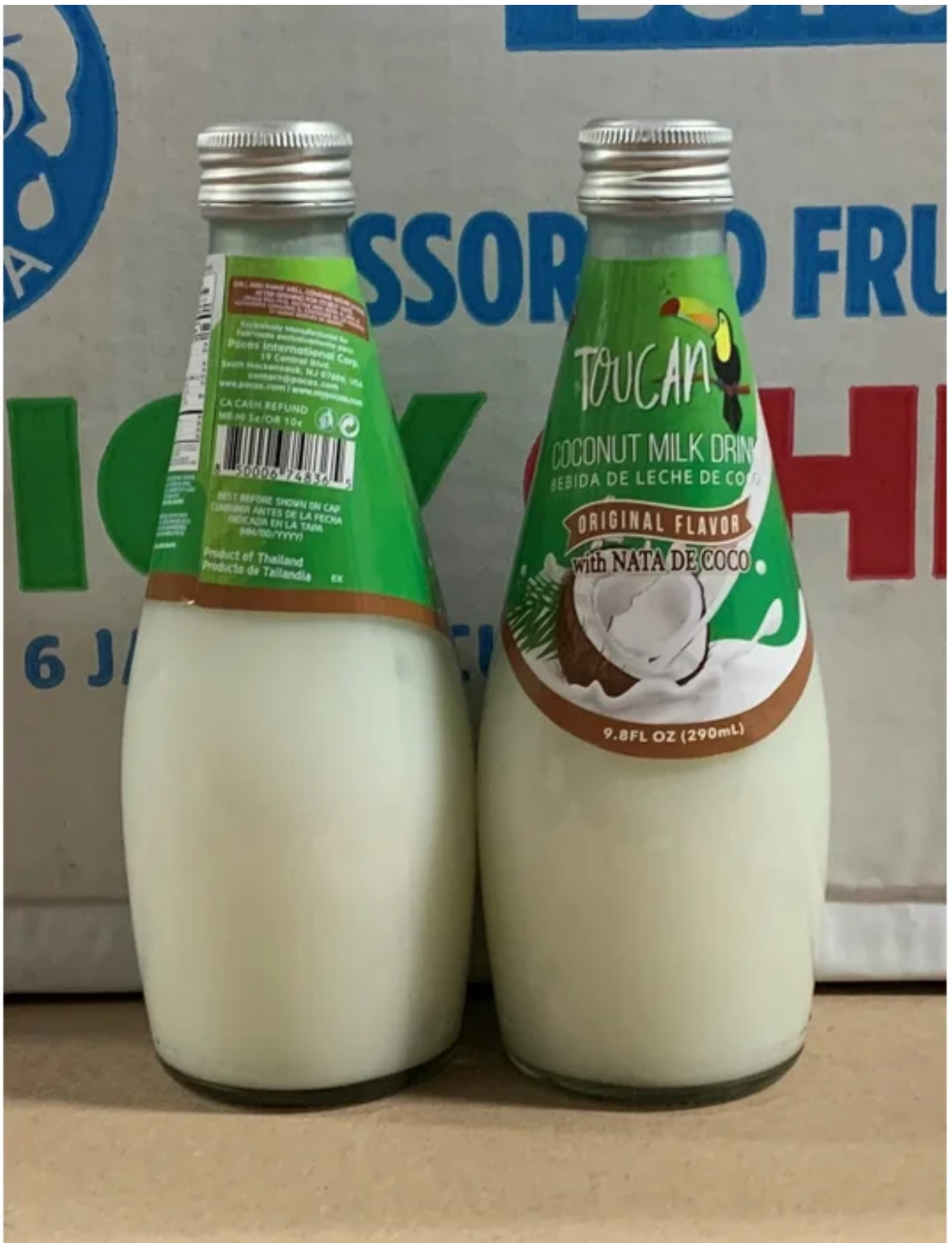
COCONUT MILK DRINK ORIGINAL 12/9.8OZ