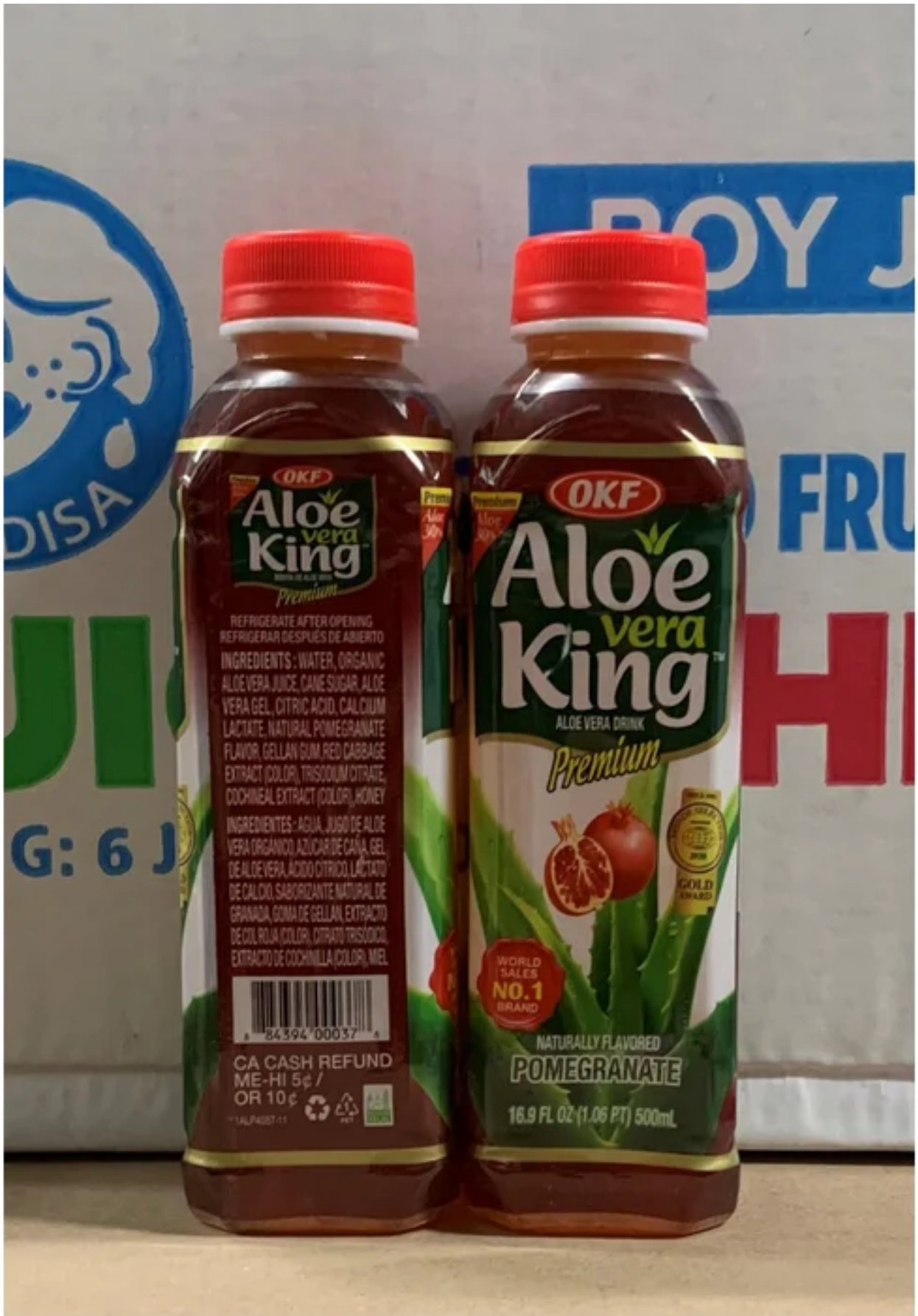
ALOE VERA KING POMEGRANATE 20/16.9OZ EXP 05/2023