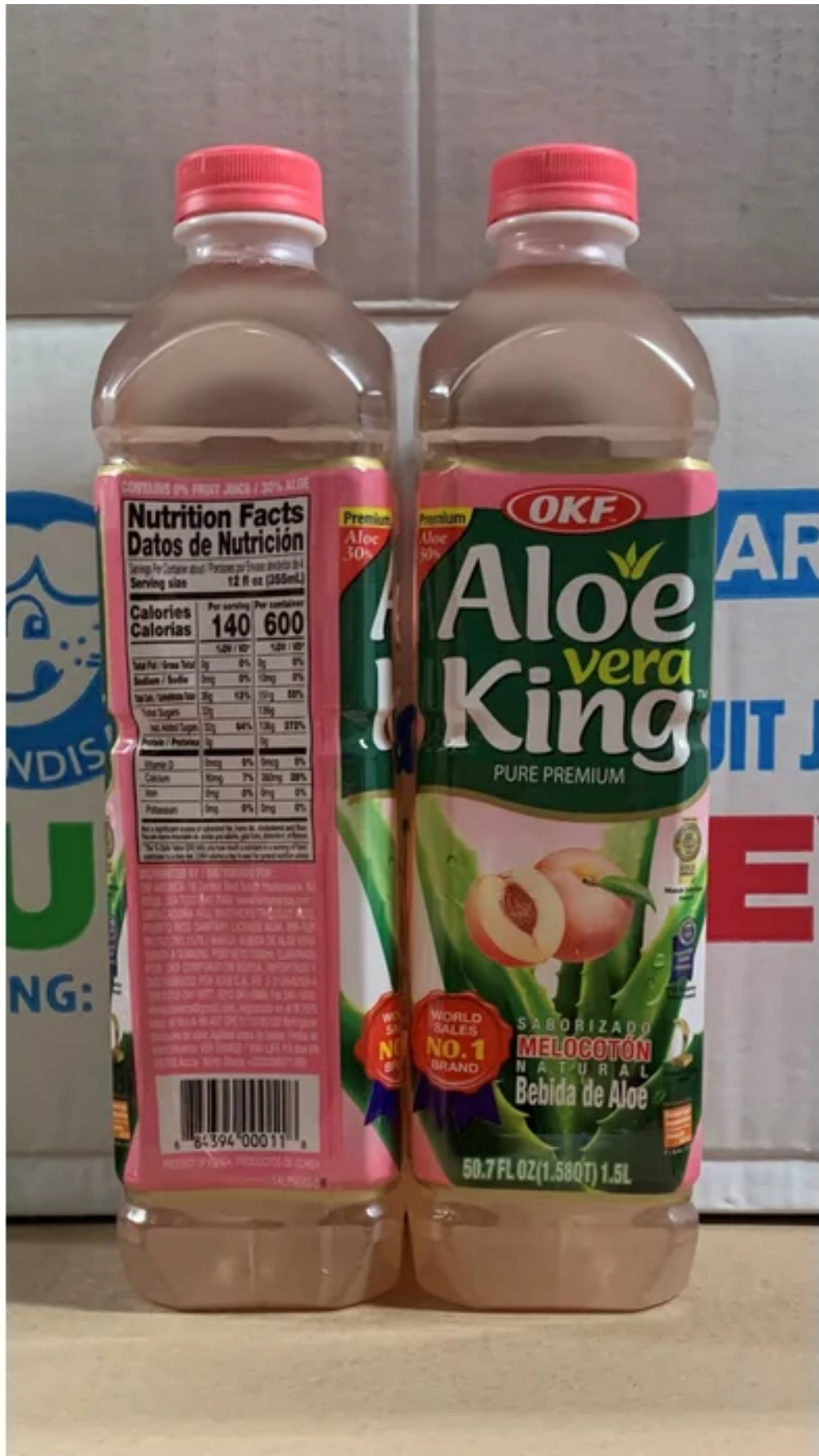
ALOE VERA KING PEACH 12/50.7OZ EXP 09/2023