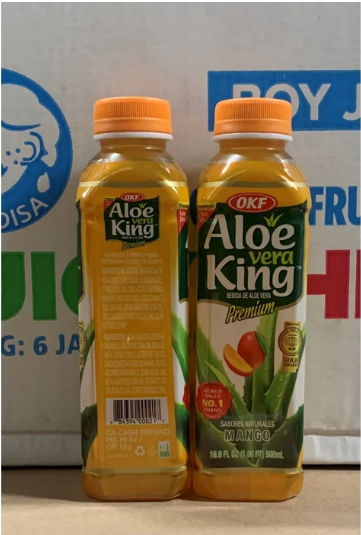
ALOE VERA KING MANGO 20/16.9OZ EXP 12/2023