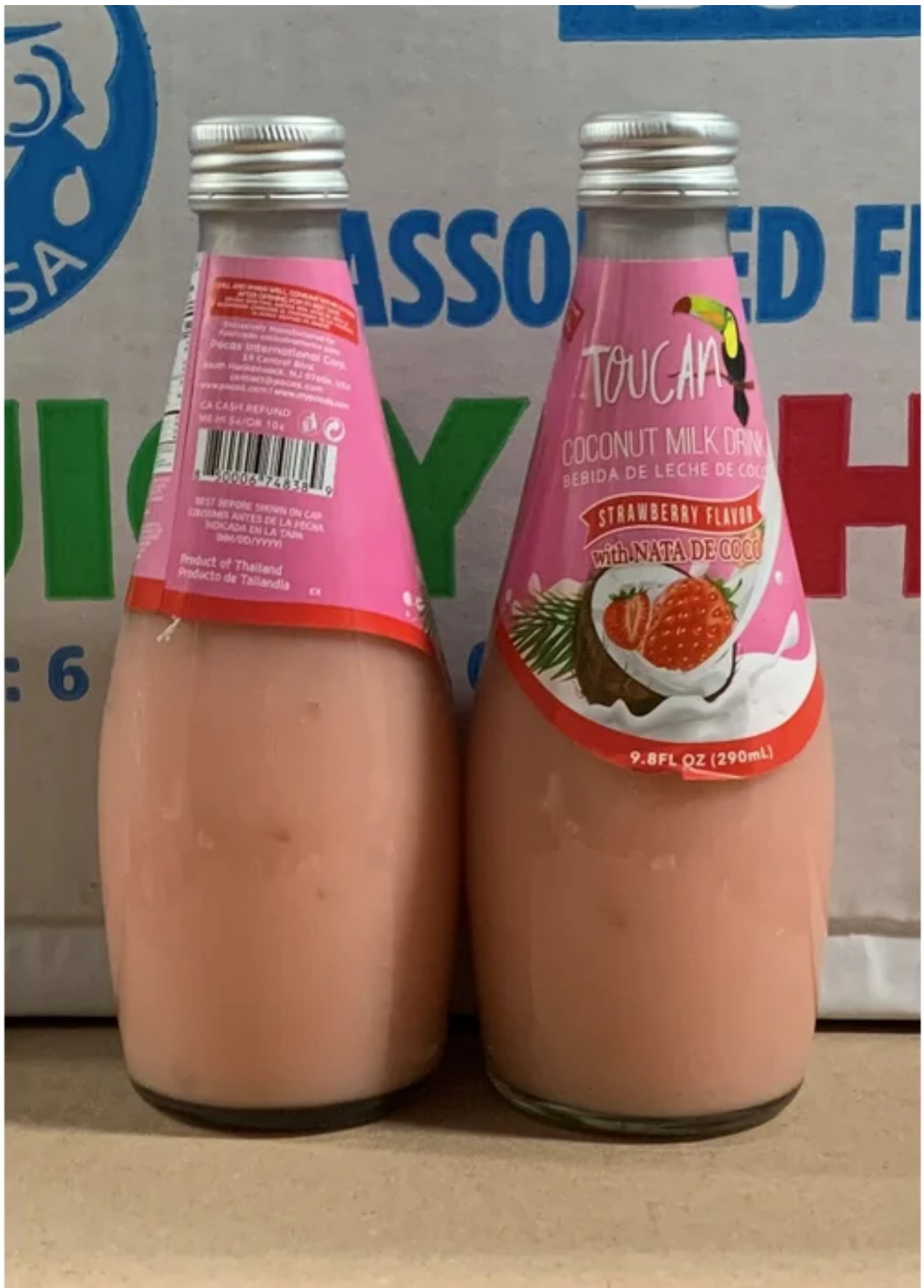
COCONUT MILK DRINK WITH STRAWBERRY 12/9.8OZ