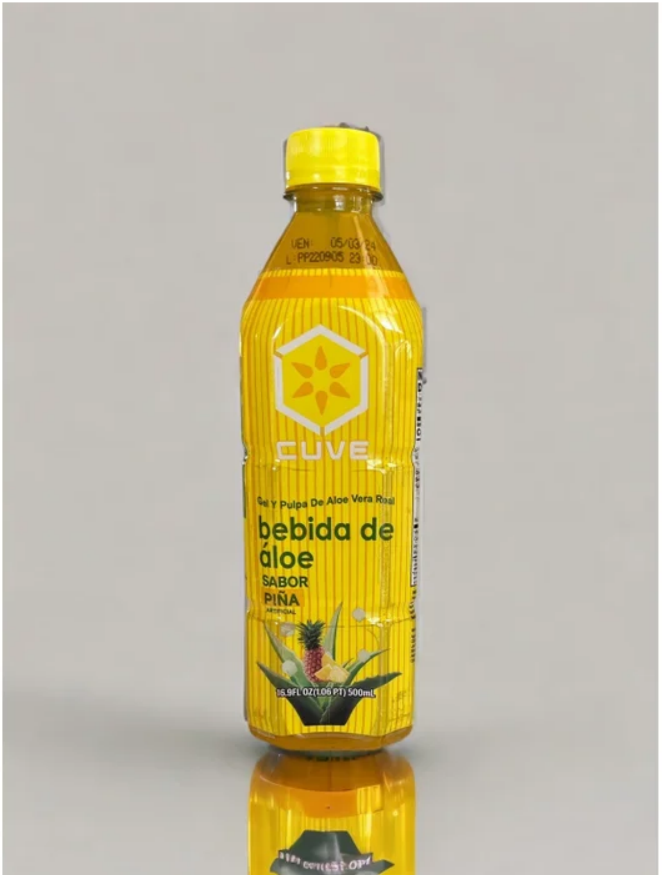
ALOE VERA DRINK PINA 12/500ML