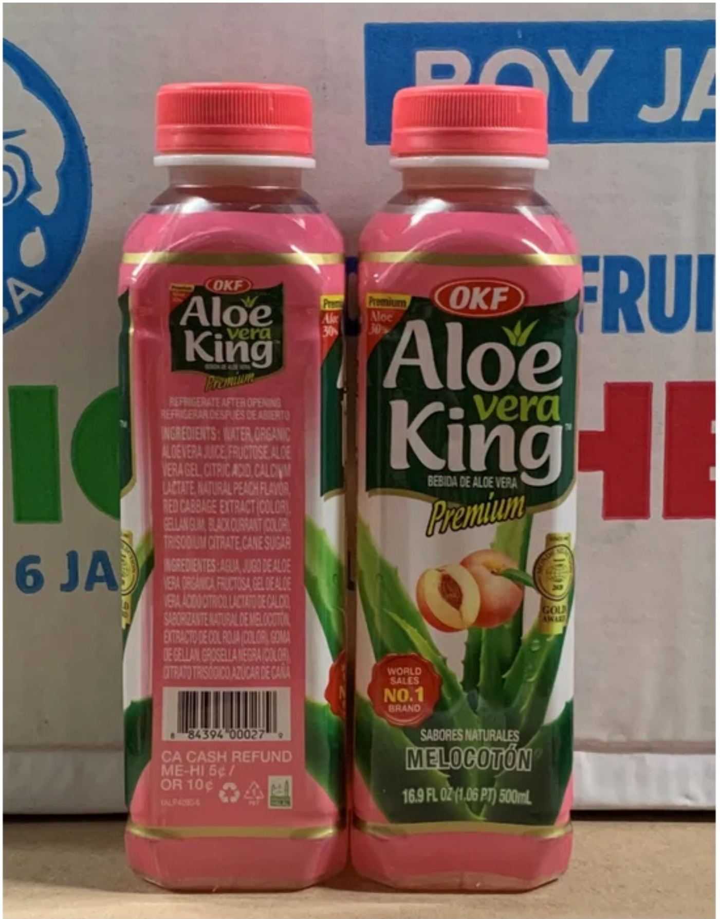
ALOE VERA KING PEACH 20/16.9OZ EXP 12/2023