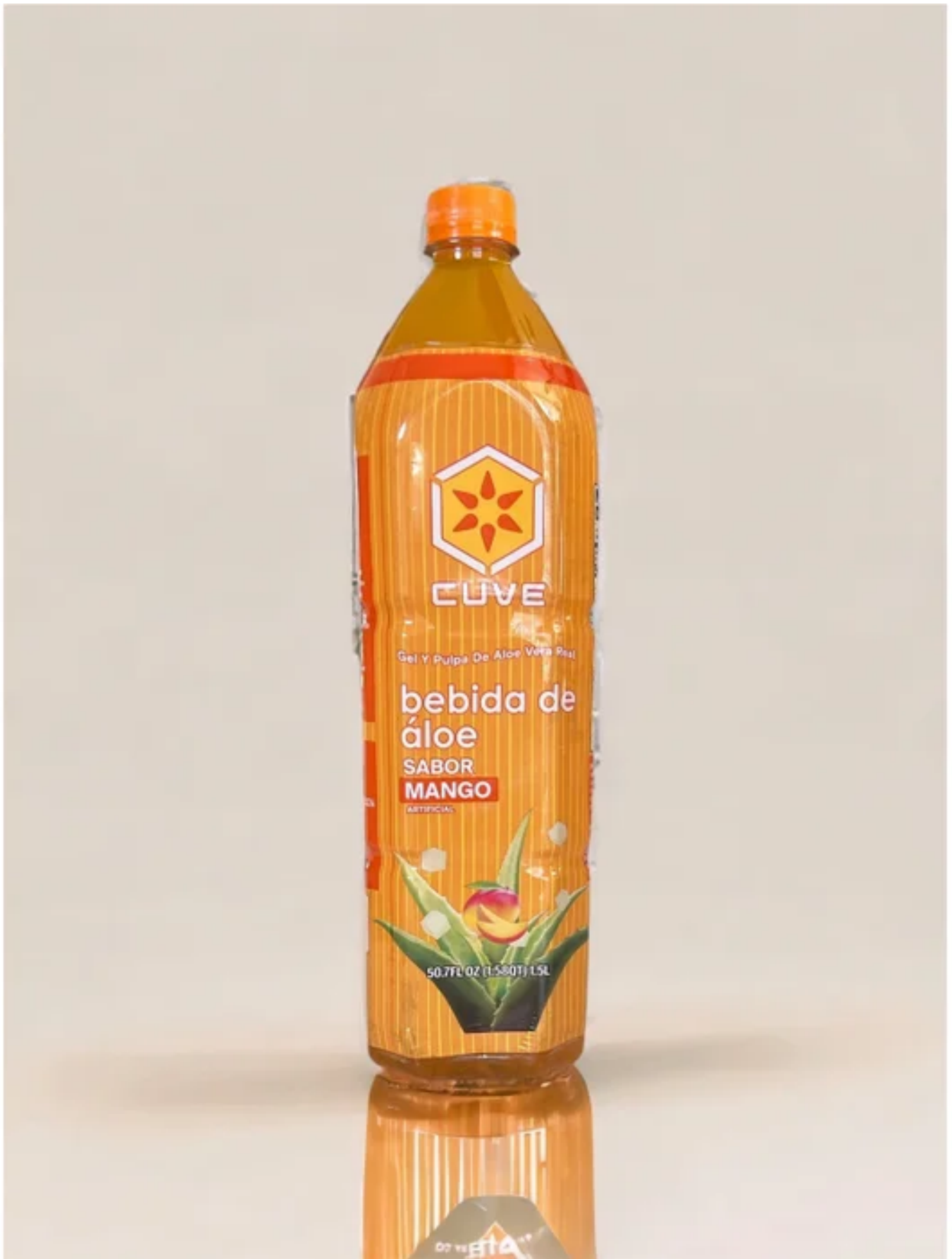
ALOE VERA DRINK MANGO 12/1.5LT